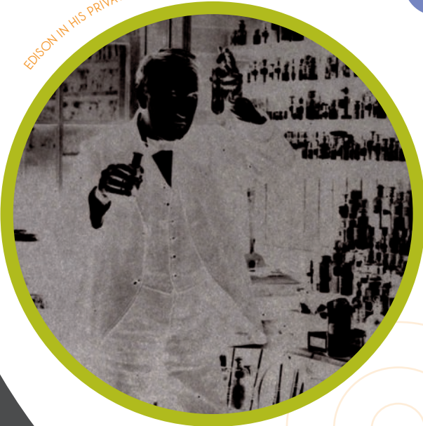
EDISON IN HIS PRIVATE EXPERIMENTAL ROOM