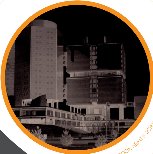
STONY BROOK HEALTH SCIENCES CENTER

How does an abandoned Colorado power plant grow into an internationally known energy solutions organization, with diverse research ranging from industrial engines to clean cookstoves to algae biofuels? The Engines and Energy Conversion Laboratory building's history and rebirth have allowed it to play a crucial role in inspiring innovation on a global scale.