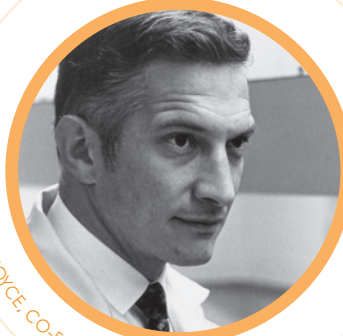
ROBERT NOYCE, CO-FOUNDER OF INTEL