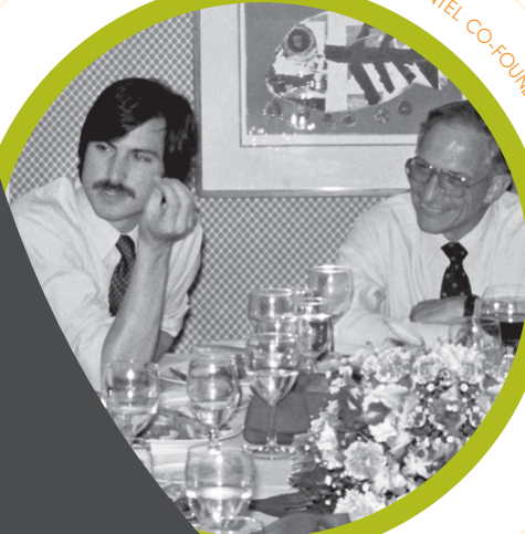
APPLE CO-FOUNDER STEVE JOBS AND INTEL CO-FOUNDER ROBERT NOYCE

Jerome and Dorothy Lemelson Center Director